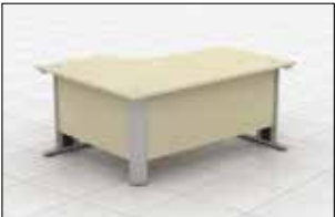
Straight Modesty Panel

Qudos desking is available with a choice of 2 modesty panels