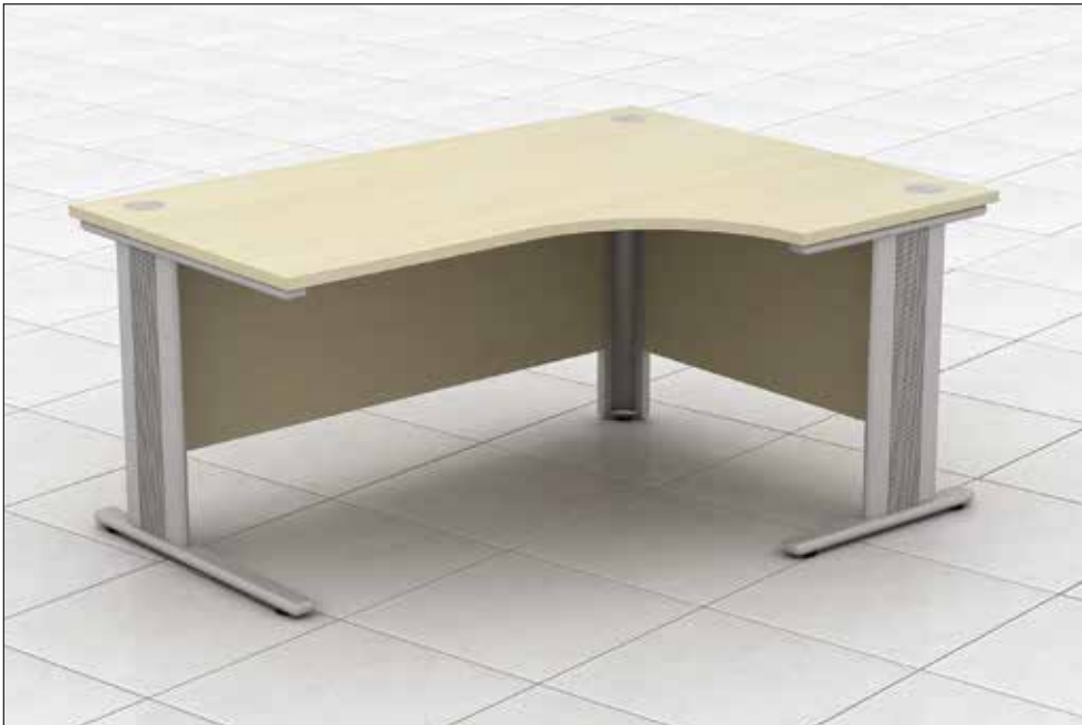
Concave Modesty Panel