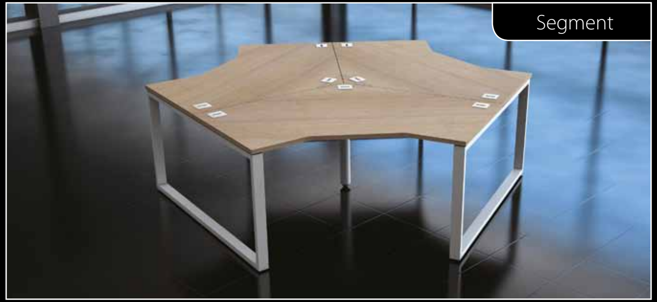
Fixed top shown