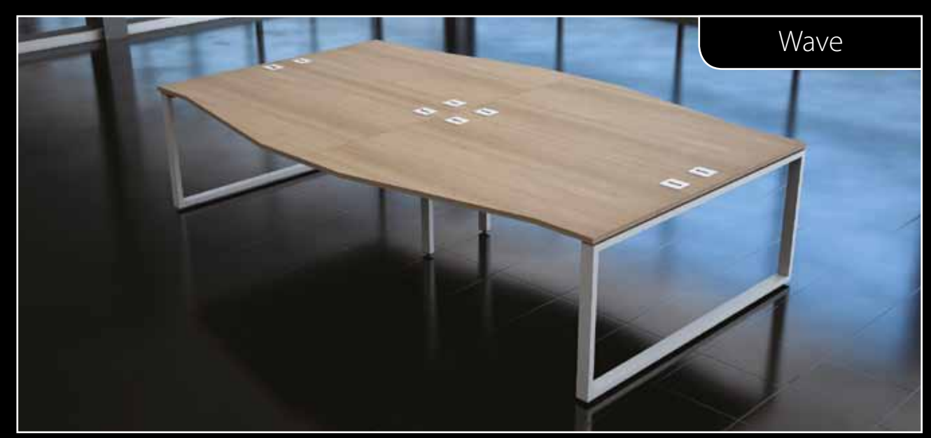
Fixed top shown