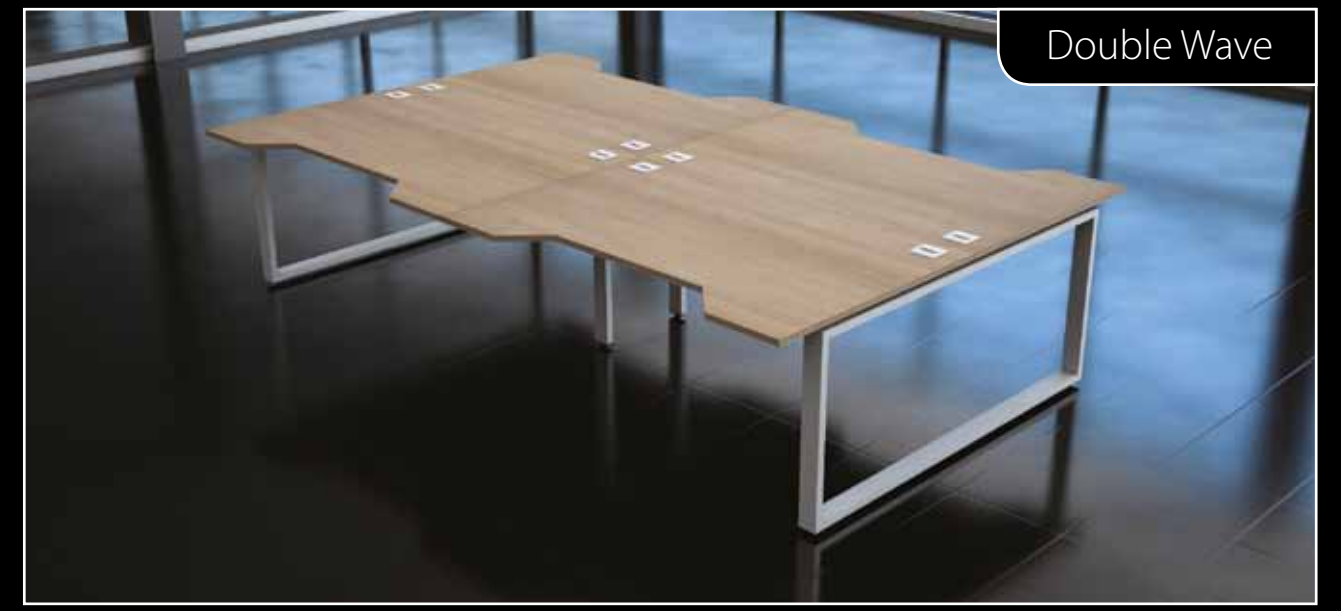
Fixed top shown