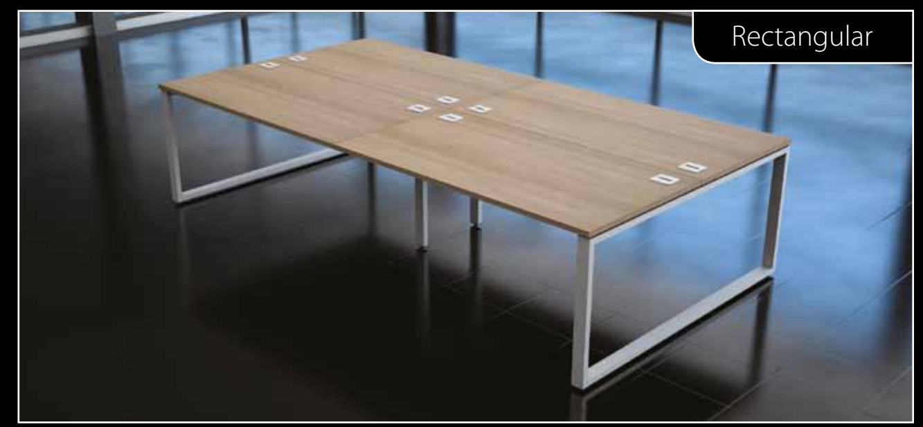
Fixed top shown