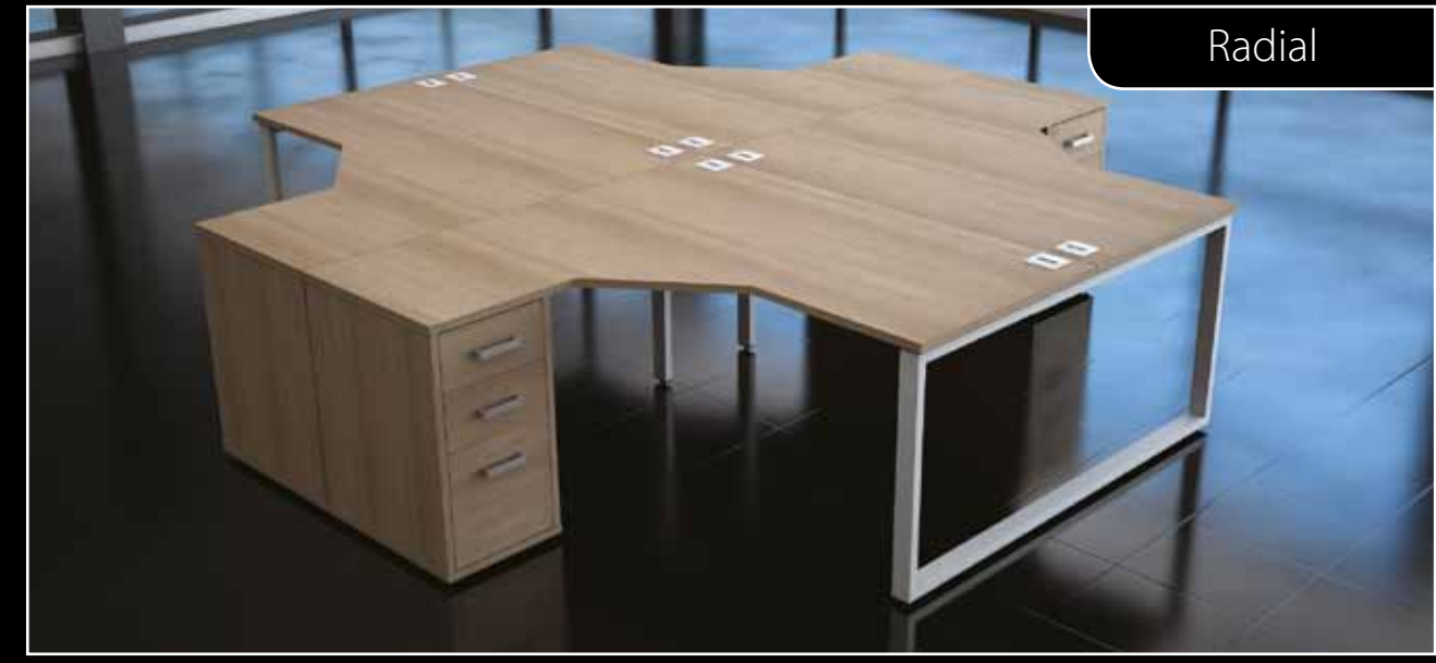
Fixed top shown